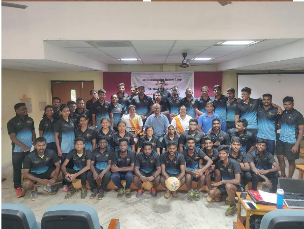
Report on Special Olympics Bharat Goa Unified Football and Unified Volleyball In collaboration with St. Xaviers Academy, Old Goa.